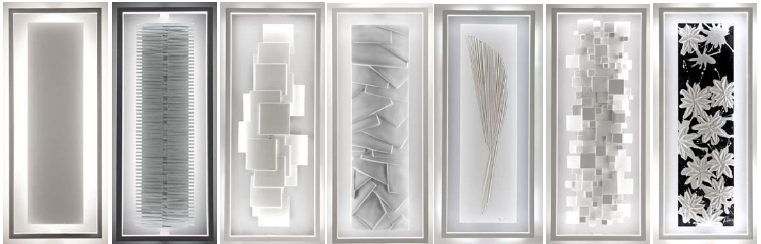
Unis Scandola Sculptural Edo Oriental Atlantis Hawaii

Weight : 10.5 kg-23 lbs in white or 10.9 kg-24 lbs in color.